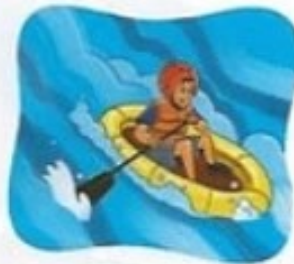
8. go rafting

If you could do anything, what would you do? I would go to Hawaii.