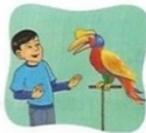
3. buy a bird