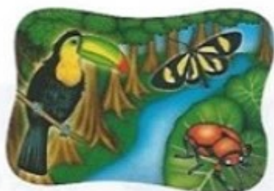
1. the Amazon jungle