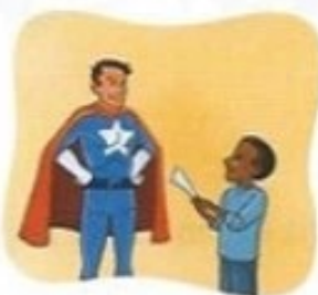
2. meet a TV star