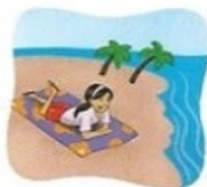
1. go to Hawaii