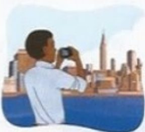
6. go to New York