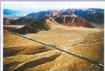
Another view of the Nazca area