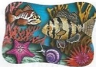
3. the bottom of the ocean