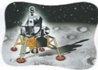
5. the moon