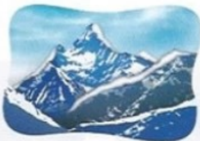
2. Mt. Everest