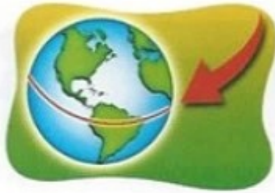
6. the equator