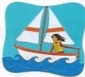
4. sail a boat