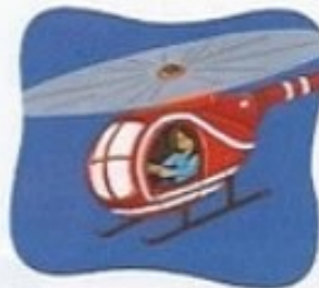
7. fly a helicopter