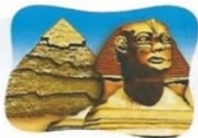
4. the pyramids of Egypt