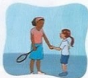
5. meet a sports star