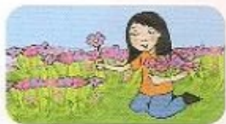
6. picked flowers