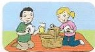
5. had a picnic