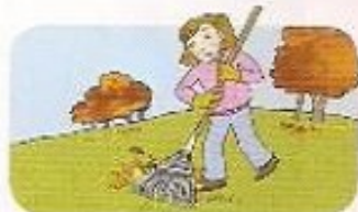
2. raked leaves