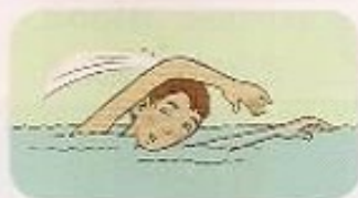
7. went swimming