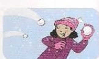
4. had a snowball fight