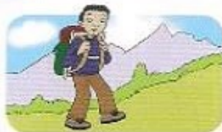
1. went backpacking