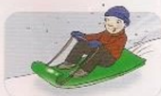
3. went sledding