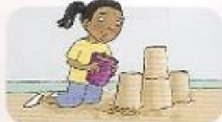
8. built a sandcastle