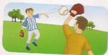
3. playing catch