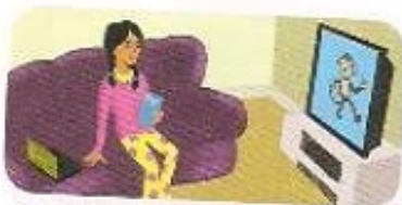
4. watching DVDs