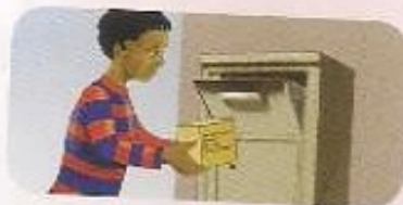
2. mailing a package