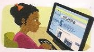
6. surfing the Internet