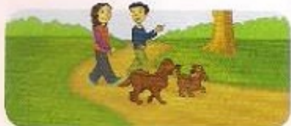
6. walking the dogs