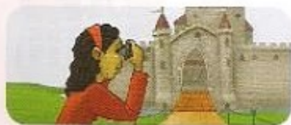
3. taking pictures