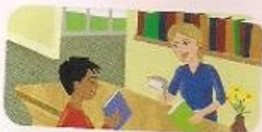
5. borrowing books