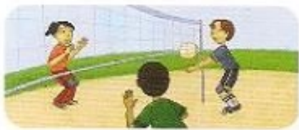
4. playing volleyball