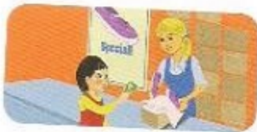
1. buying sneakers