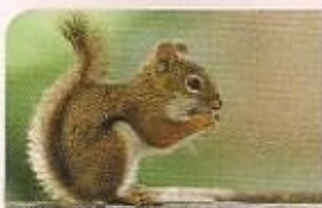
7. a squirrel 19 kph