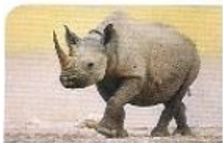
5. a rhinoceros 43 kph