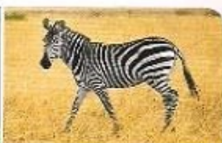
2. a zebra 64 kph