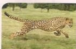
3. a cheetah 114 kph