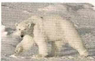
6. a polar bear 43 kph