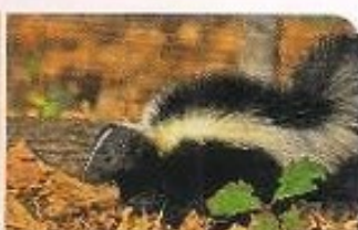
8. a skunk 12 kph