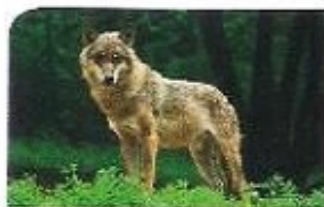
1. a wolf 64 kph