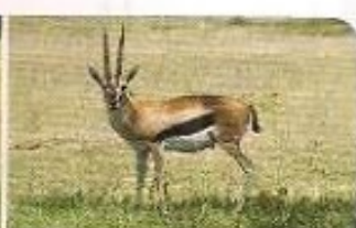
4. a gazelle 80 kph