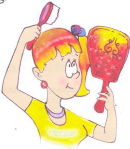
DARLENE IS LOOKING AT HERSELF IN THE MIRROR.