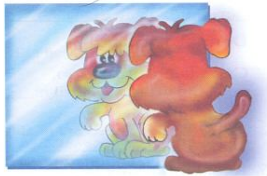
SANDY IS LOOKING AT ITSELF IN THE MIRROR.